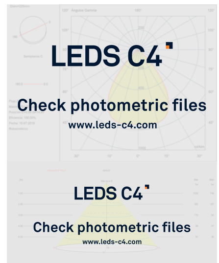
Image may not match reference. LedsC4 reserves the right to amend any of the product's components. The data related to flux, power and colour temperature may be subject to changes made by the manufacturer.